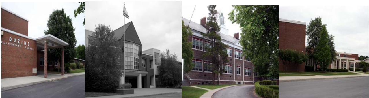
Central High School